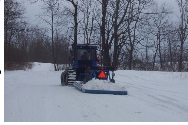
Club VP Ron Shultes out grooming on C7B in Knox.

15000! Club membership stands at 483, an all time high for Frontier. A large