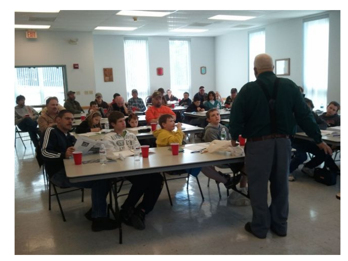
The students are listening carefully during the course. Lunch was served and all students passed the class. Well done!