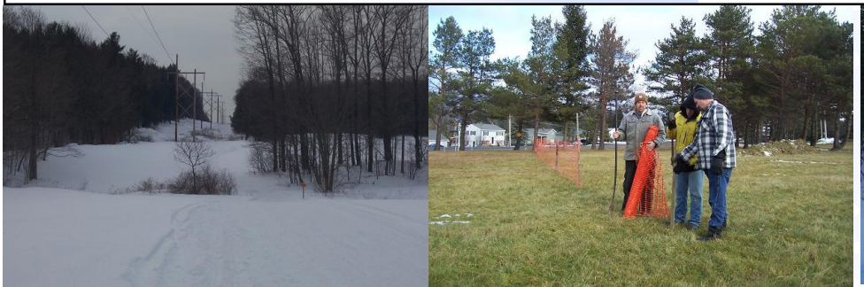
Trail C7B near Mt View Lane.

Election of NYSSA officers will happen on April 17 at the forum. This is will be an important vote. These issues and more should be heard by members at this year's forum in Liverpool. (Frontier Sno Riders can send 16 delegates to the forum this year. Hopefully we will have many members attend.)