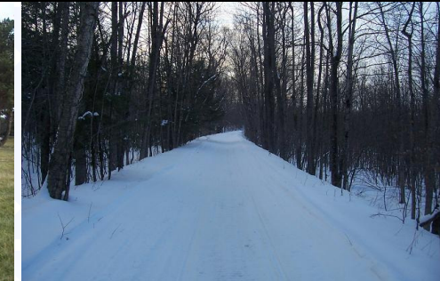
Mott Rd section of Trail C7B.