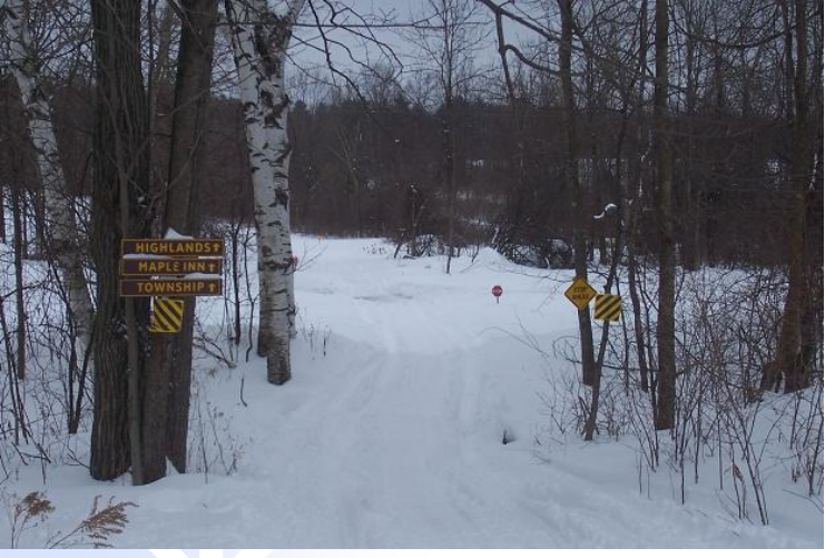
New signs were posted this season showing distance and direction to local businesses.